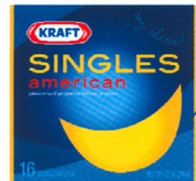
CONCEPT DESIGN 2