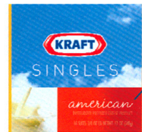
CONCEPT DESIGN 1

How it was created: Wong said he approaches the design process like one would carefully dismantle a classic car. The team isolated the Kraft logo, the word “Singles,” the color blue and other elements and assigned a value to each in order to determine which should be left behind and which should be built upon. While consumers liked many of the whimsical design explorations they were shown in the testing phase, they responded best to the one that was most similar to the current design. This streamlined version substituted photos of fresh vegetables, milk and bread for once-busy text and colored boxes. The directive was inspired by work Spring did for Kraft’s Salad Dressings line, which used transparent packaging to convey product freshness.