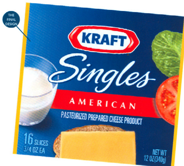
THE FINAL DESIGN