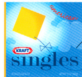
CONCEPT DESIGN 3